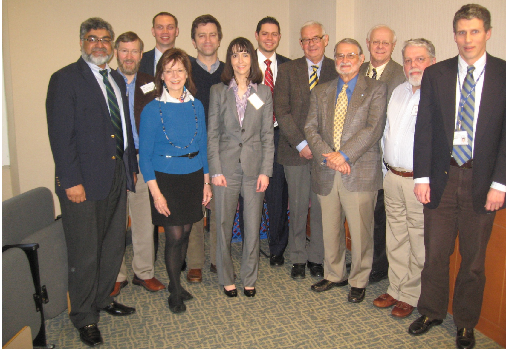
The Duke group and some more